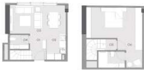
1+1 C KAT

Özellikler genel olarak inşaat projeleri ile ilgili engelemler, yerleşme alanları, yapılaşma oranları, yapı kalitesi ve diğer teknik şartnamelerle uyumlu olarak belirtilmiştir. İnşaat, teslimat, teslimat sonrası ve diğer hususlar için lütfen inşaat sözleşmesini inceleyiniz. *Daire alanı, satışa esas alan alanı kapsamaz. Örneğin balkon alanı. **Satışa esas alan, diğer alanlar dahil toplam alanı ifade eder.