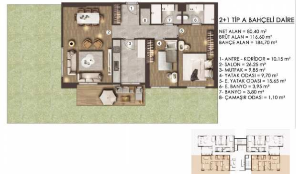
ZEMİN KAT PLANI