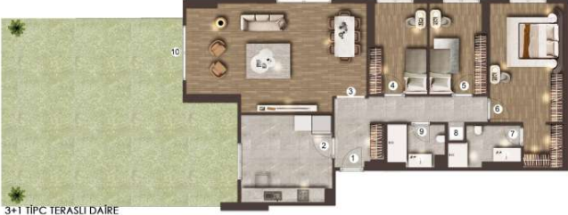
3+1 TİPİ TERASLI DAİRE

NET ALAN = 109,60 m 2 BRÜT ALAN = 158,90 m 2 TERAS ALAN = 132,20 m 2