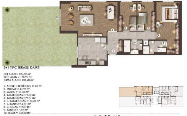
1. KAT PLANI